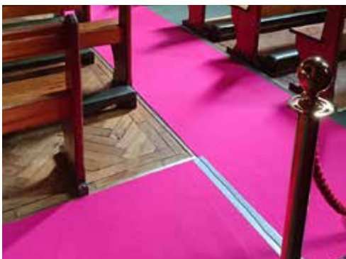
This pink carpet was fitted in Flint, North Wales. It went from the Church door round a corner and up the aisle.