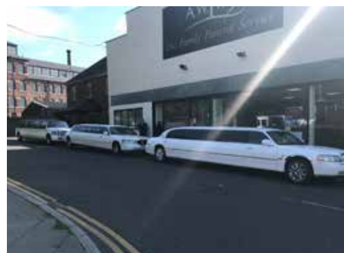
These white limousines were organised by a client and provided seating for 28.