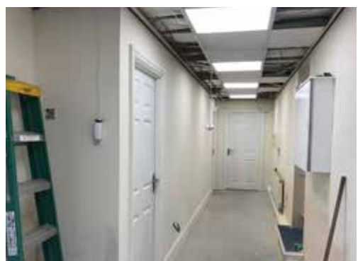
The old administration office where a corridor has been created to separate out the three new offices..