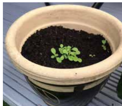
We received this photograph of the Forget-Me-Not seeds, from one of our Father's Day advice cards, sprouting!