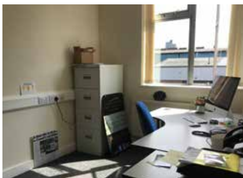
Marketing in Jackie's old room.